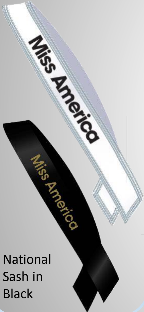
National Sash in Black